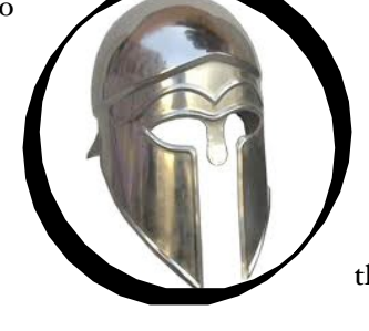
Use every piece of God's armor to resist the enemy in the time of evil, so that after the battle you will still be standing firm. Ephesians 6:13

You will have the opportunity to experience Wildmen at your own pace. However, the platoons (small groups) which meet at the end of our meetings are instrumental in spiritual growth and in fostering lifelong bonds of friendship.